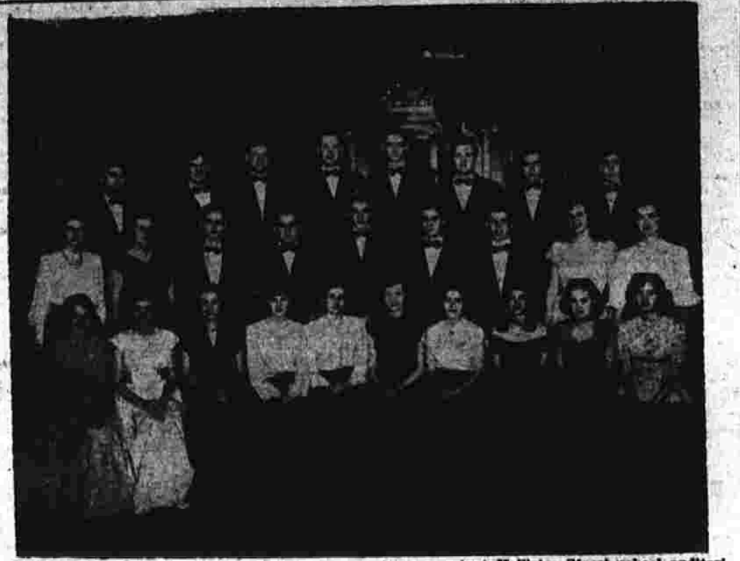
The Odikon Stagers of Tufts College who will present a concert at Hollister Street school auditorium Thursday, April 15 at 8 p. m. for the Kiwanis club. Proceeds will go towards purchase of Audubon's Birds Library for Manchester schools. This includes records, movies and film strips.